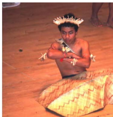
The Commonwealth Countries Fair

In August we performed over two evenings at the Pacific Olympic Village at St Catherine's Dock; and in November, we again performed at the annual Commonwealth Countries League Fair in Kensington, and were, as for last year, the opening act.